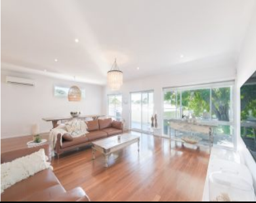
9 Reid Street Marks Point, NSW