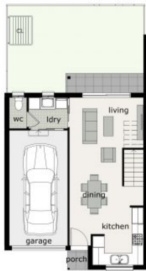
Ground Floor Unit 2