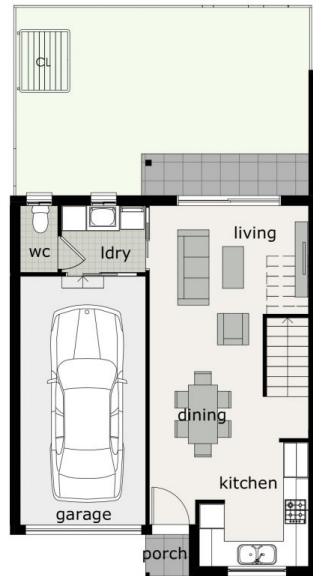
Ground Floor Unit 2