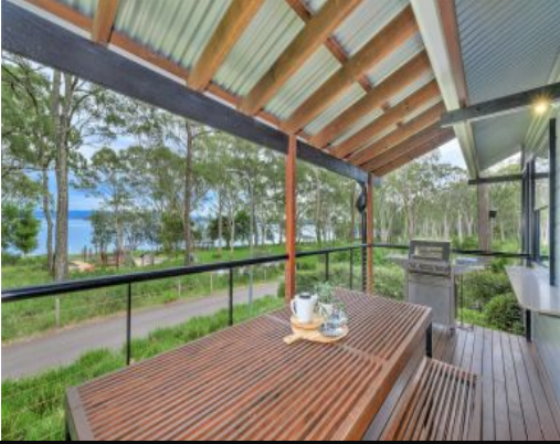
10 Saltwater Row Murrays Beach, NSW