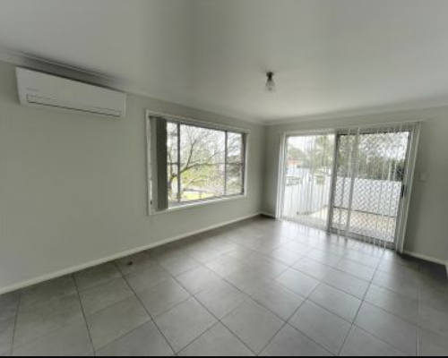
128A Northcote Avenue Swansea, NSW