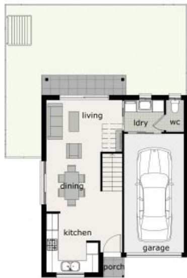
Ground Floor Unit 3